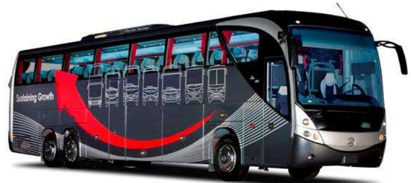
New MCV 600