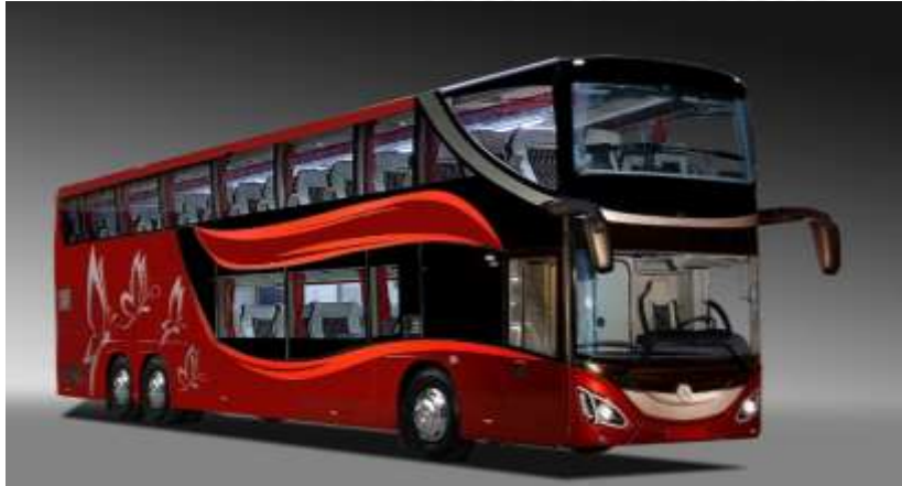
MCV 800 Double Deck