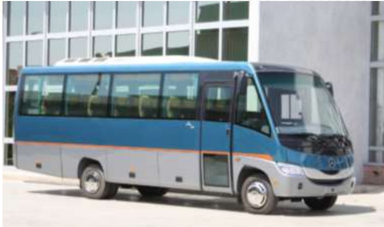
MCV 260 T