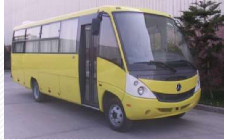
MCV 260 R